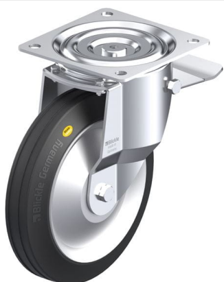
Corresponding standard locking L-RD 250K-ST-FA