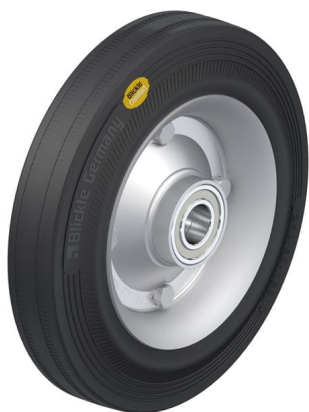
Wheel used RD 250/25K