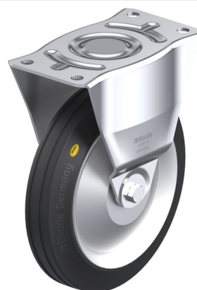
Corresponding rigid caster B-RD 250K-FA