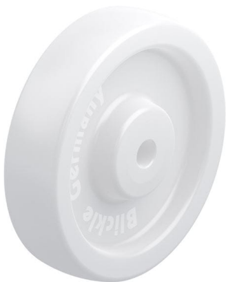
Wheel used SP0 200/20G