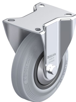
Corresponding rigid caster B-VPP 125G-SG-FA