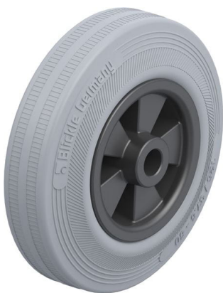
Wheel used VPP 125/12G-SG