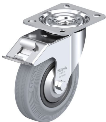
Corresponding standard locking L-VPP 125G-FI-SG-FA