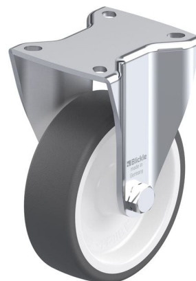
Corresponding rigid caster BH-POTH 125G-1