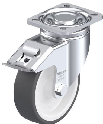
Corresponding standard locking LH-POTH 125G-1-FI