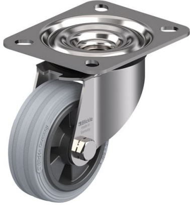
Corresponding swivel caster LEX-VPP 80XR-SG