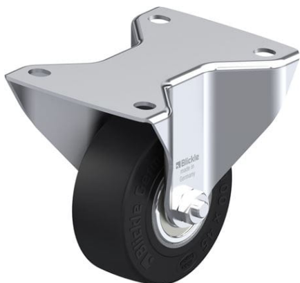
Corresponding rigid caster BK-SE 100K-3