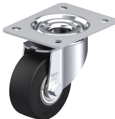
Corresponding swivel caster LK-SE 100K-3