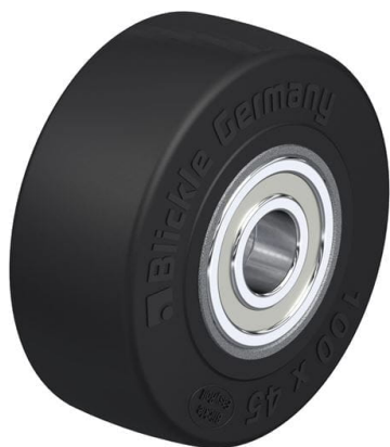
Wheel used SE 100/20K