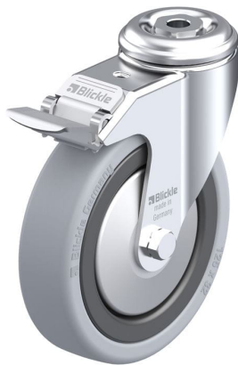
Corresponding standard locking LKRA-VPA 126G-11-FI-FA