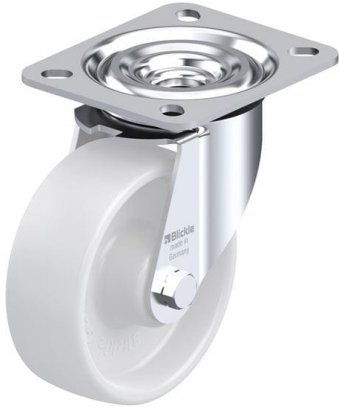
Corresponding swivel caster L-PO 100XR