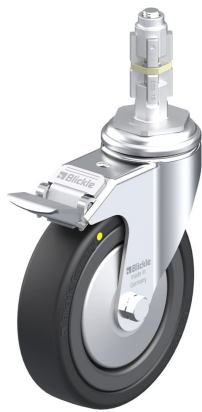
Corresponding standard locking LKRA-VPA 126K-11-FI-EL-FA-E13