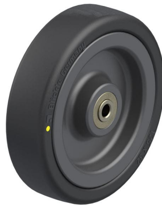
Wheel used VPA 126/8K-EL