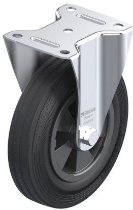
Corresponding rigid caster B-VPP 200R