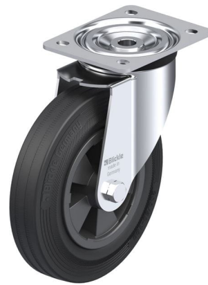
Corresponding swivel caster L-VPP 200R