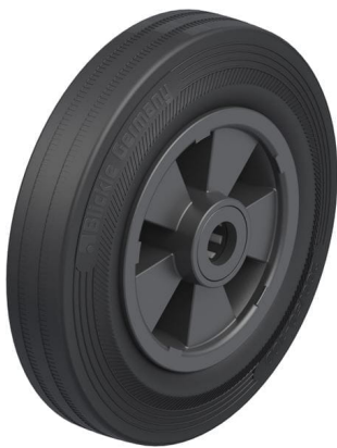
Wheel used VPP 200/20R