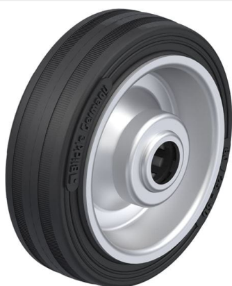
Wheel used V 80/12R