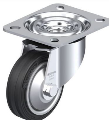
Corresponding swivel caster L-V 80R-FA