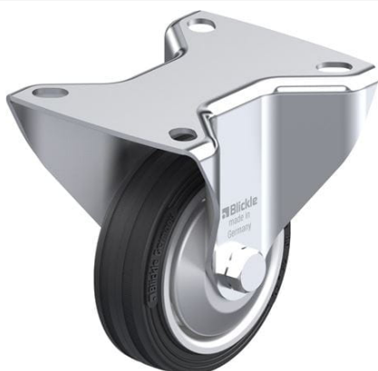
Corresponding rigid caster B-V 80R-FA