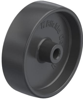
Wheel used POA 75/8G