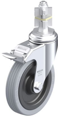
Corresponding standard locking LKRA-VPA 125K-11- FI-E15