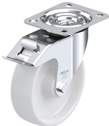
Corresponding standard locking LE-PO 125R-FI