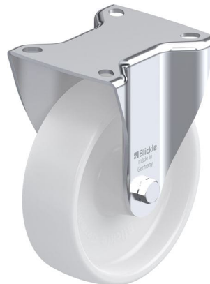
Corresponding rigid caster B-PO 125R