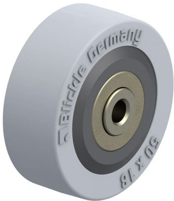
Wheel used VPA 50/6K