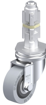
Corresponding swivel caster LRA-VPA 50K-E03