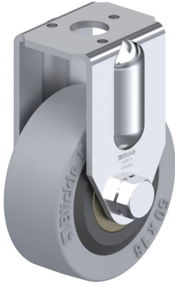
Corresponding rigid caster BRA-VPA 50K