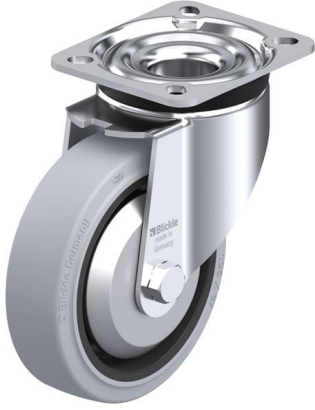
Corresponding swivel caster LK-POEV 125R-1-SG-FA