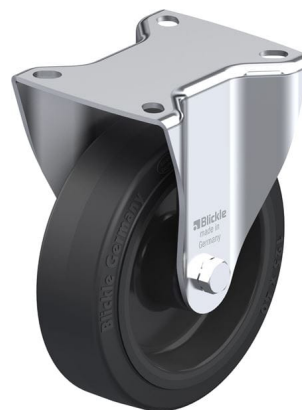
Corresponding rigid caster B-POEV 125R