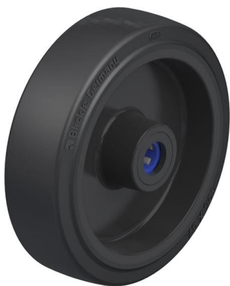
Wheel used POEV 125/12R