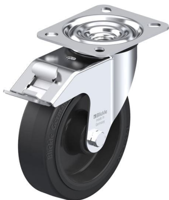
Corresponding standard locking LE-POEV 125R-FI