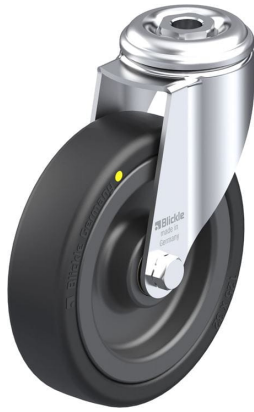
Corresponding swivel caster LKRA-VPA 126K-EL