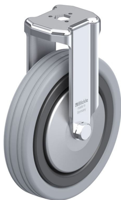
Corresponding rigid caster BKRA-VPA 125K-FA