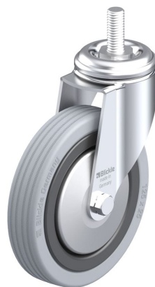
Corresponding swivel caster LKRA-VPA 125K-FA-GS12