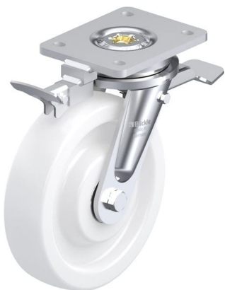
Corresponding standard locking LO-SP0 200K-ST-RI4