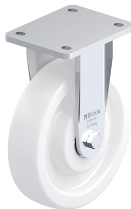
Corresponding rigid caster BO-SP0 200K