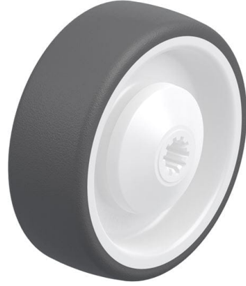
Wheel used POTH 100/10KA