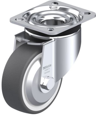
Corresponding swivel caster LK-POTH 100KA-1-FA