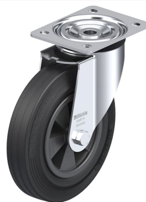
Corresponding swivel caster L-VPP 200G