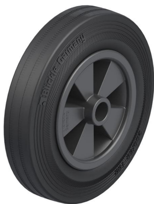
Wheel used VPP 200/20G