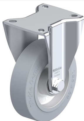
Corresponding rigid caster BH-ALEV 125K-1-SG