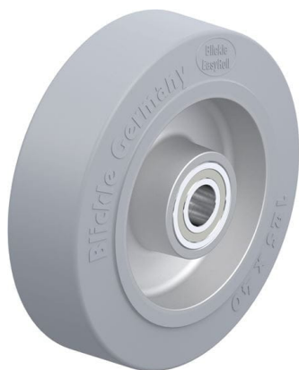
Wheel used ALEV 125/15K-SG