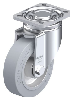
Corresponding swivel caster LH-ALEV 125K-1-SG