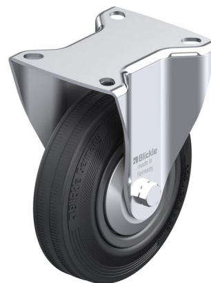
Corresponding rigid caster B-VPP 125R-FA