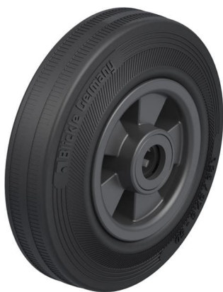
Wheel used VPP 125/12R