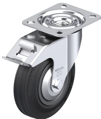
Corresponding standard locking LE-VPP 125R-FI-FA