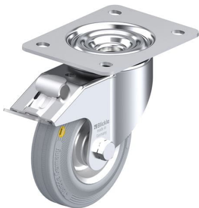
Corresponding standard locking LK-RD 125R-3-FI-VLI