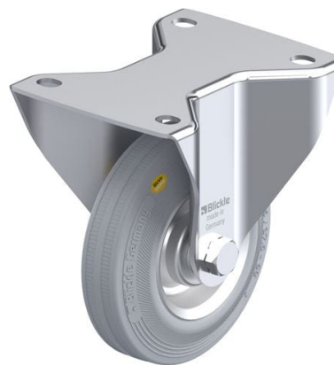
Corresponding rigid caster BK-RD 125R-3-VLI