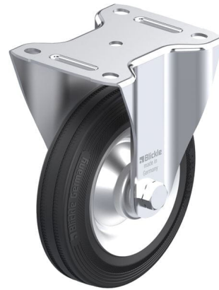
Corresponding rigid caster B-V 162R