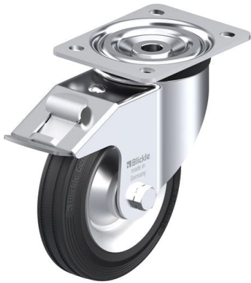
Corresponding standard locking L-V 162R-FI