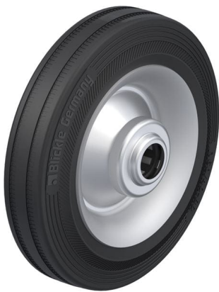
Wheel used V 162/20R