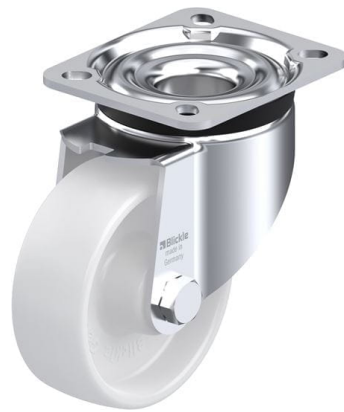
Corresponding swivel caster LK-PO 100XR-1