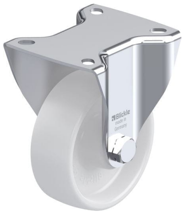
Corresponding rigid caster BK-PO 100XR-1