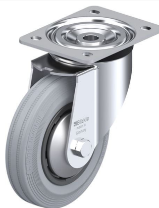
Corresponding swivel caster L-VPP 160R-SG-FA