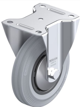
Corresponding rigid caster B-VPP 160R-SG-FA