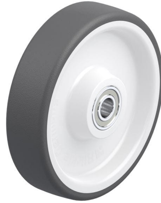
Wheel used POTH 200/20K