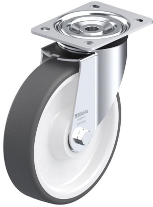
Corresponding swivel caster L-POTH 200K