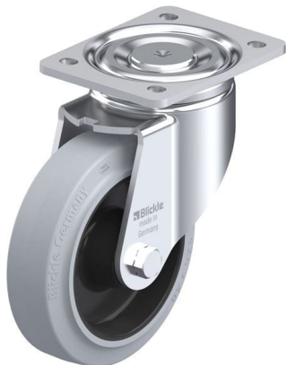
Corresponding swivel caster LH-POEV 160R-SG