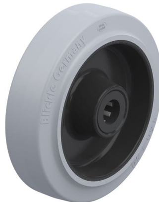
Wheel used POEV 160/20R-SG