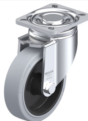
Corresponding swivel caster LH-POEV 125R-1-SG