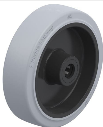
Wheel used POEV 125/15R-SG