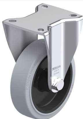
Corresponding rigid caster BH-POEV 125R-1-SG