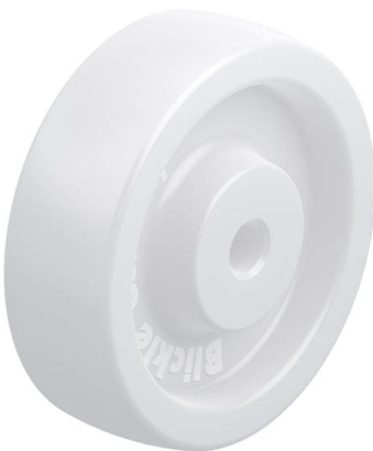
Wheel used SP0 125/15G