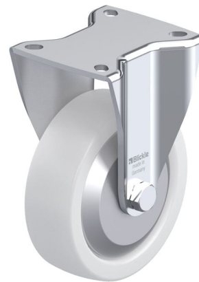
Corresponding rigid caster BH-SP0 125G-1-FA