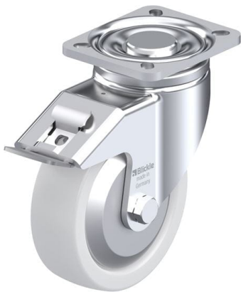
Corresponding standard locking LH-SP0 125G-1-FI-FA