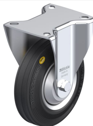
Corresponding rigid caster B-RD 125R-FA