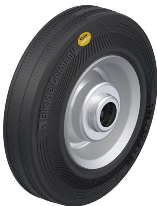
Wheel used RD 125/15R