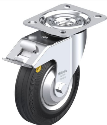
Corresponding standard locking L-RD 125R-FI-FA