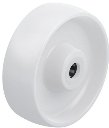
Wheel used PO 150/20R