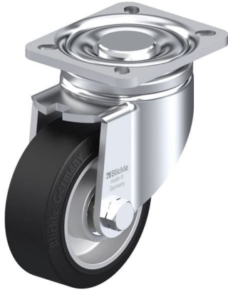
Corresponding swivel caster LH-ALEV 100K-1