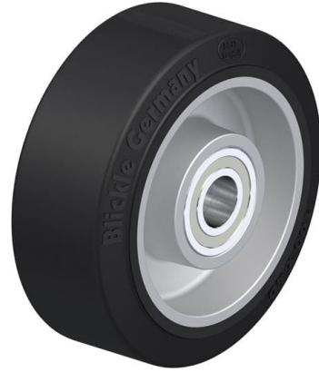
Wheel used ALEV 100/15K