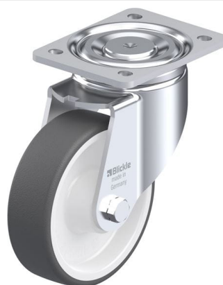
Corresponding swivel caster LH-POTH 150R