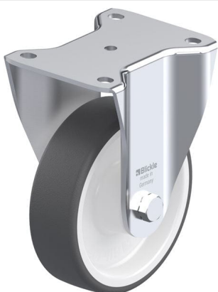
Corresponding rigid caster BH-POTH 150R