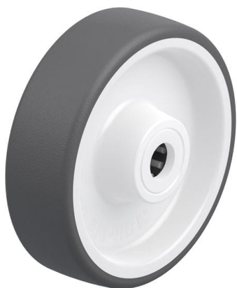
Wheel used POTH 150/20R