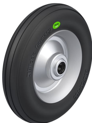
Wheel used VW 202/20R