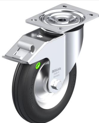
Corresponding standard locking L-VW 202R-FI