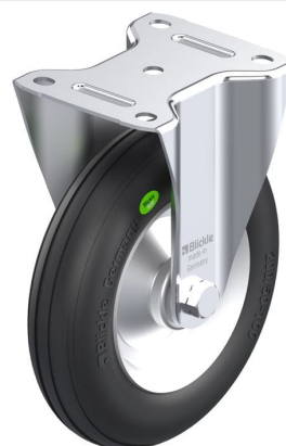
Corresponding rigid caster B-VW 202R