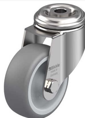
Corresponding swivel caster LKRXA-TPA 80G