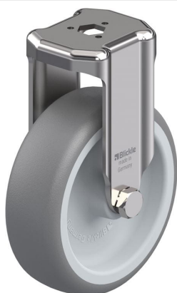
Corresponding rigid caster BKRXA-TPA 101G