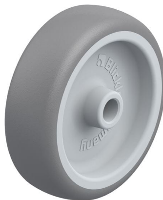
Wheel used TPA 101/12G