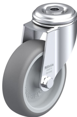
Corresponding swivel caster LKRA-TPA 101G-11