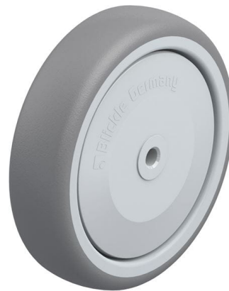
Wheel used TPA 126/8KF