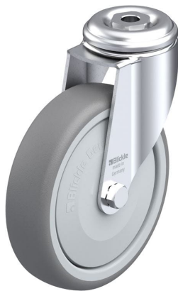
Corresponding swivel caster LKRA-TPA 126KF-11