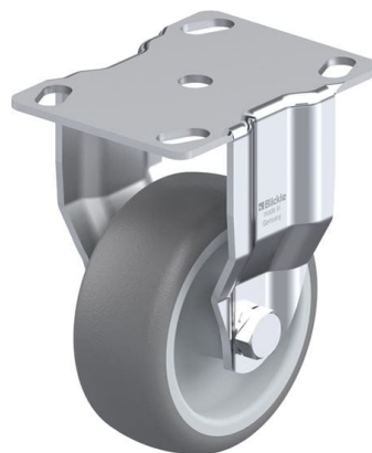
Corresponding rigid caster BKPA-TPA 80G