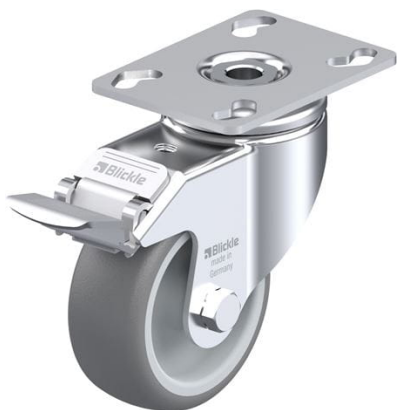
Corresponding standard locking LKPA-TPA 80G-FI