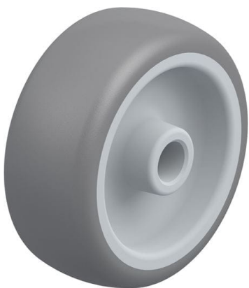
Wheel used TPA 80/12G