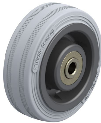
Wheel used VPA 80/8K