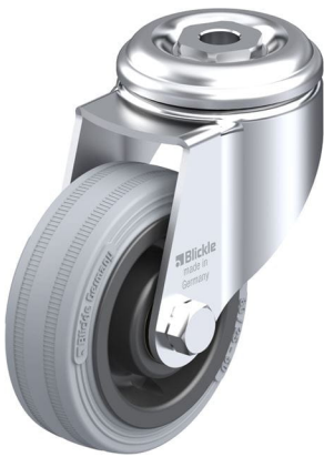
Corresponding swivel caster LKRA-VPA 80K-11