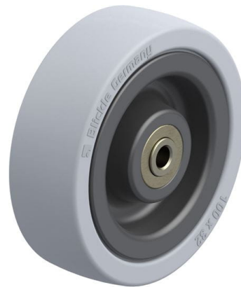
Wheel used VPA 101/8K