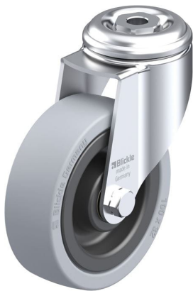
Corresponding swivel caster LKRA-VPA 101K-11