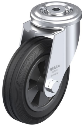
Corresponding swivel caster LER-VPP 150G