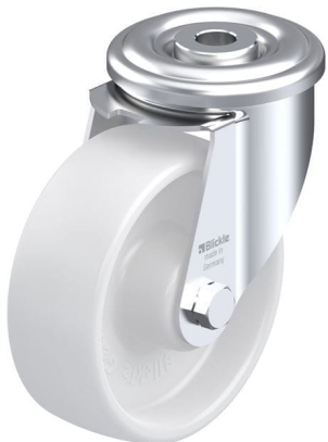
Corresponding swivel caster LER-PO 100R