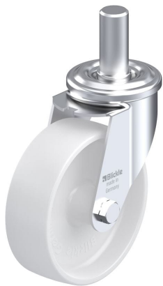
Corresponding swivel caster LEZ-PO 150G-27