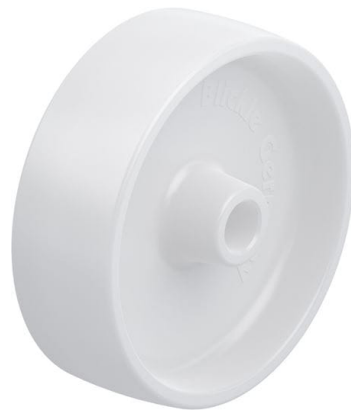
Wheel used PO 150/20G