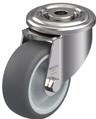
Corresponding swivel caster LEXR-PATH 80G