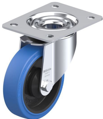
Corresponding swivel caster LK-POEV 125KA-3-SB