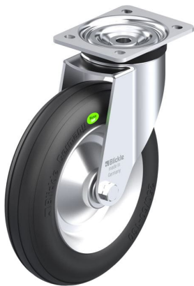
Corresponding swivel caster L-VW 252R-3