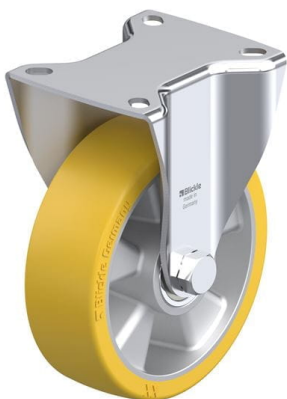
Corresponding rigid caster BK-ALTH 125K-1