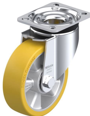
Corresponding swivel caster LK-ALTH 125K-1