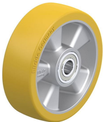
Wheel used ALTH 125/15K